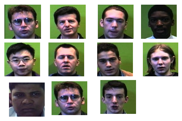
Figure 2: Images from test database

An Eigen faces approach which represents a PCA method in which a small set of significant features are used to describe the variation between face images [1].Face recognition algorithms are divided into three categories, Geometric feature based methods, where the significant facial features are detected and the distances among them as well as other geometric characteristics are combined in a feature vector for face representation [13]. Template based methods, which are the most popular technique used to recognize and detect faces, use a feature vector that represents the entire face template rather than only the most significant facial features. Model based methods, where a mathematical model is fitted for each face and models are compared in recognition process [13]. Eigen face approach is one of the earliest appearance-based face recognition methods, which was developed by M. Turk and A. Pentland in 1991. This method utilizes the idea of the Principal Component Analysis (PCA) which decomposes a face image into a small set of characteristic feature images called Eigen faces and recognition ( Identification ) is performed by projecting a new face onto a low dimensional linear "face space" defined by the Eigen faces, followed by computing the distance between the resultant position in the face space and those of known face classes [5].