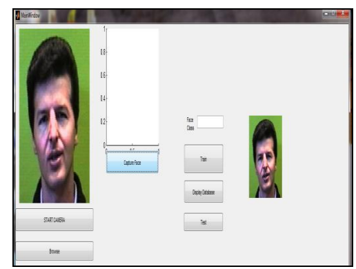
Figure 6: After capturing the image

Once the image is captured and training is done, the image for testing is browsed from the testing database and if the image is matched then the result will be shown as "recognized image".